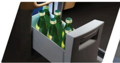
Beverage cabinet with cooling and heating function.

Our extra-large panoramic sunroof brings in natural light, making the cabin exceptionally bright, thoughtfully paired with double-layer glass that blocks 99% of UV rays.