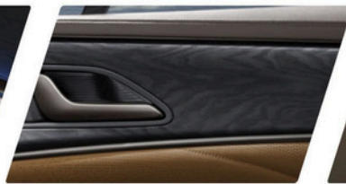
Genuine Wood Panel Touch of Nature.