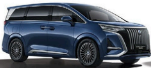
Whale Sea Blue