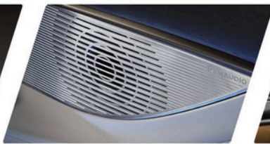
Dynaudio speaker HIFI-class sound system.